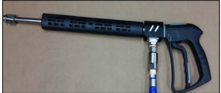
SteamPro High-Flow Fixed Gun