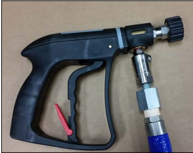
SteamPro Adaptable Gun