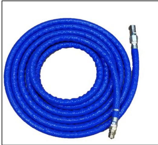
Steam Gun Hose