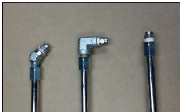
Tips left to right: 45°, 90° & straight